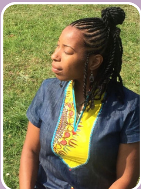
Host & Yoga Teacher @akomaheartuk